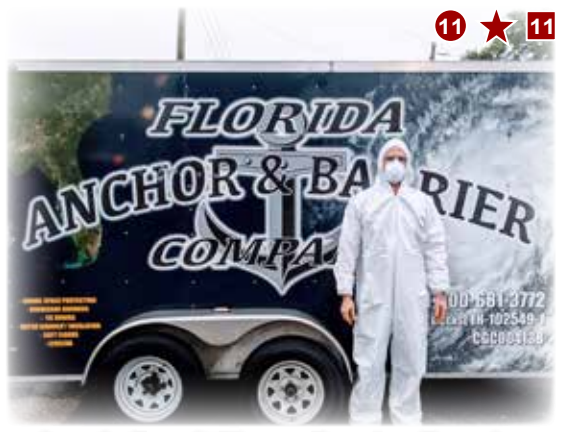
Insulation & Vapor Barrier Repairs Soft Floor Repairs & Laminate Flooring

Wishing you good health and safety, The Florida Anchor & Barrier Team